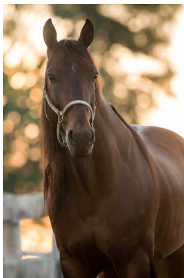
Canada's Horse of the Year State Treasurer