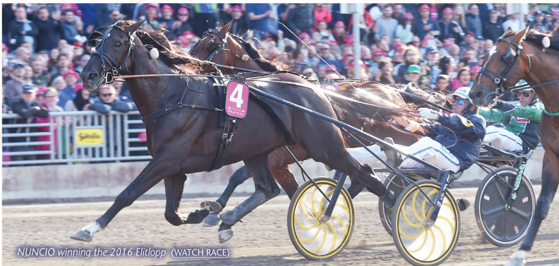
NUNCIO winning the 2016 Elitlopp (WATCH RACE)

NOW AVAILABLE TO NORTH AMERICAN BREEDERS