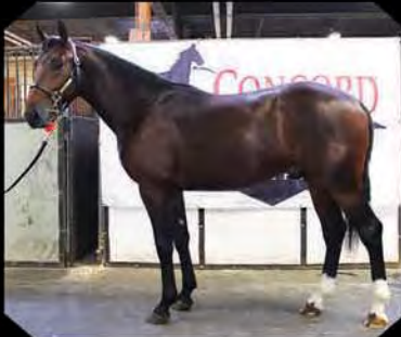
#424 Western Vintage-Pacific Classic Purchased by Brian Brown

First crop yearlings were very well received at the 2017 sales. We thank the breeders, buyers and trainers for their confidence in Western Vintage and wish them great success in 2018. Yearlings below were sold at Harrisburg.