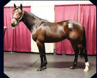
#685 Western Vintage-Jus' Chilln Out Purchased by Joe Seekman

WESTERN VINTAGE was a force to be reckoned with at 2, setting his mark of 1:49.4 in the Bluegrass Stakes at The Red Mile in Lexington beating the field of top level colts by four lengths, pulling away from the field!