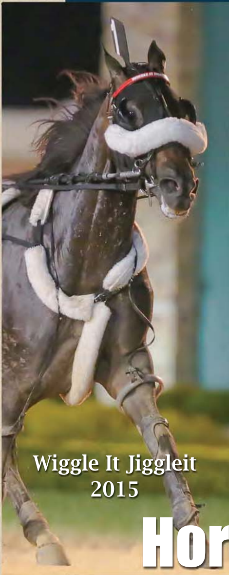
Wiggle It Jiggleit 2015

3 years; 3 Champions; 3 Indiana-sired Horses