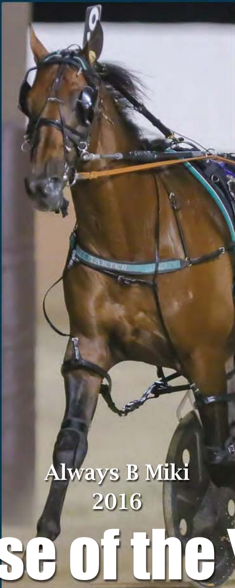
Always B Miki 2016