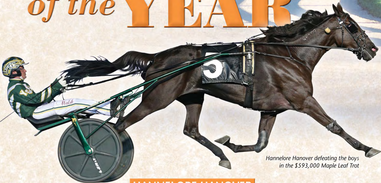
Hannelore Hanover defeating the boys in the $593,000 Maple Leaf Trot