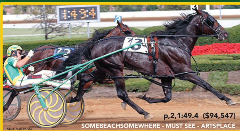
SOME BEACHSOMEWHERE - MUST SEE - ARTSPLACE