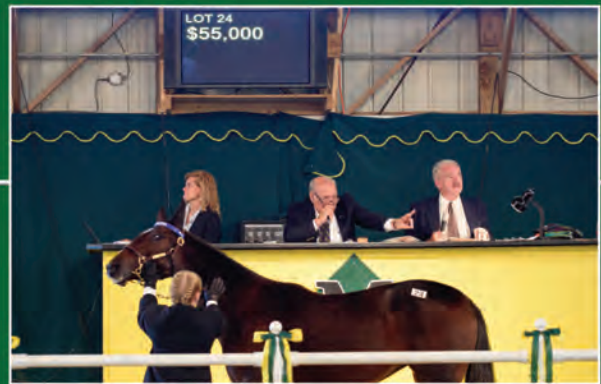
Sale Topper Royal Pinot - RC Royalty - Graduation Party, photo Jim Gillies

If you are interested in advertising with us please contact Wilma