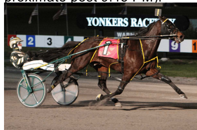
Foiled Again draws six hole for Levy final

Post time for the 12-race card is 7:10 PM, with the (ladies first) Matchmaker going as the 6th race (approximate post 8:45 PM) and the Levy going as the 9th race (approximate post 9:45 PM).