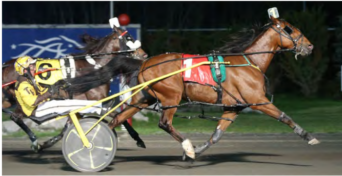
New Image Media

The much anticipated match up between State Treasurer and Wiggle It Jiggleit developed around the final turn Saturday night at Mohawk Racetrack, but neither horse came away with the victory.