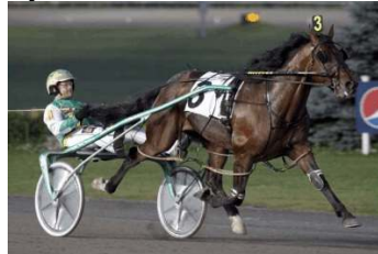
It's on to Plan B for Warrawee Needy

Warrawee Needy (E Dees Cam), a top candidate for the North America Cup, missed what was expected to be his 3-year-old debut last night in the Upper Canada Cup eliminations at Georgian Downs.