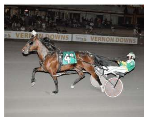
Major Look gets the win at Vernon Downs

American Jewel (American Ideal) could do no better than second in her 2012 debut last night at Vernon Downs. The heavy favorite in the wagering in the New York sire stakes event, she finished 2 1/4 lengths behind Major Look (Art Major).