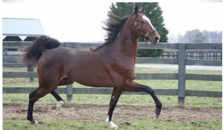
Badlands Nitro by Badlands Hanover out of Pleasant Thoughts courtesy of Winbak Farm of NY