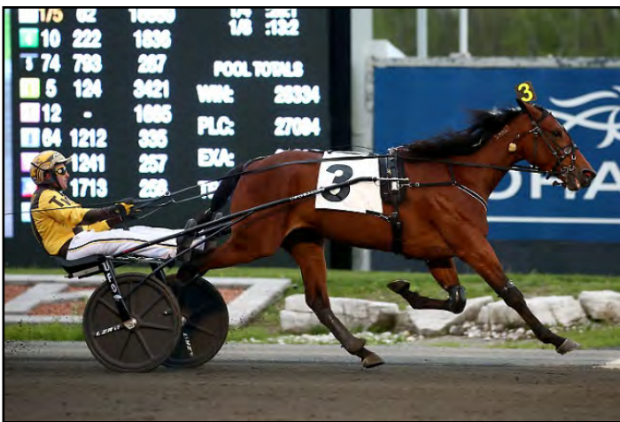
New Image Media