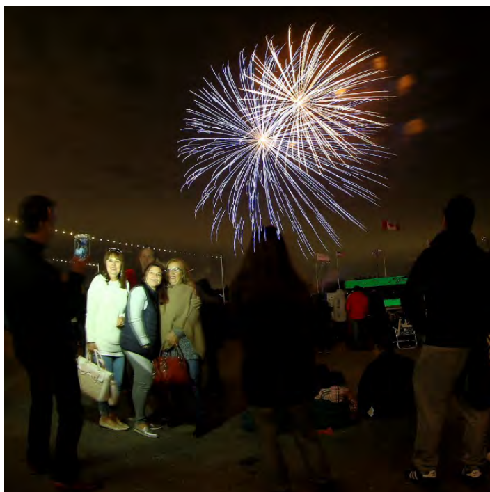
New Image Media