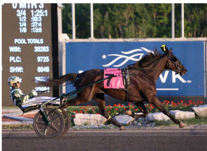
New Image Media