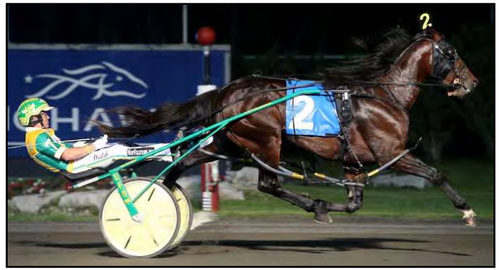
New Image Media

The 1-5 bettor's choice held command past the mid-way point in :55, which is when an eager Ocean Colony made his bid for the front. The 9-2 third choice couldn't catch up to his front-stepping foe but added pressure as they passed the