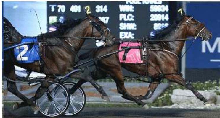
In The Arsenal held off Penji Hanover