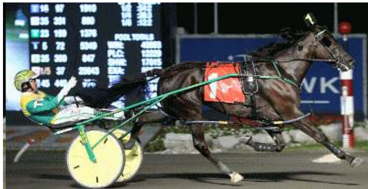
Wakizashi Hanover upsets Artspeak in third and final NA Cup elimination