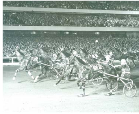
Those were the days...Thor Hanover winning the 1962 Messenger before a packed house

In the spring of 1962, some buddies and I were young wise guy regulars at Roosevelt and Yonkers in New York.