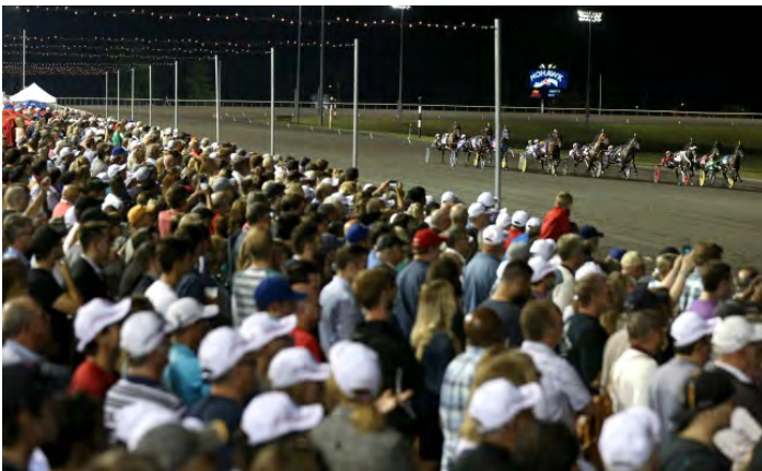
New Image Media

In some events for tonight's Pepsi North America Cup program at Mohawk I choose as many as four contenders. However, there are other races where I may only note two or three, assessing the remainder of the finishing positions to be cases of general chaos, which is an opportunity for players to go with exotic partners that close with high odds.