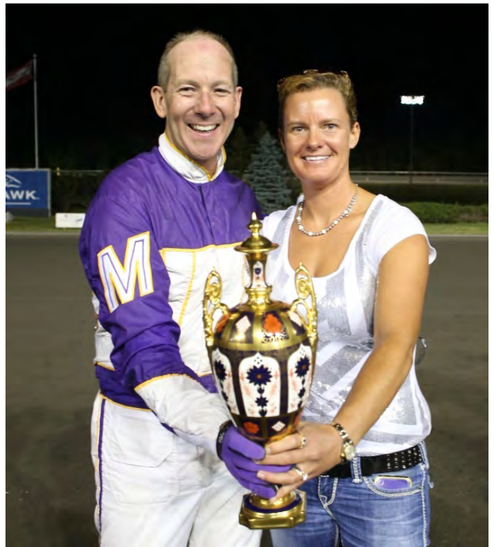
New Image Media