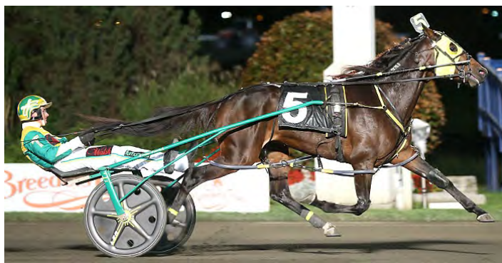
New Image Media

Don't overlook the fantastic Freaky Feet Pete (Trace Tetrick) and many others.