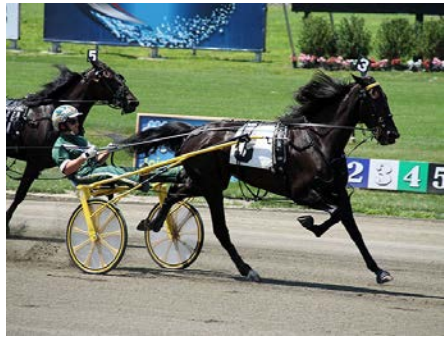
Mission Brief was a winner in a Meadowlands qualifier yesterday

EAST RUTHERFORD, NJ - Breakfast With The Babies was held on a picture-perfect Friday morning with moderate temperatures, clear skies and a slight cross breeze as the races began at 9:30am.