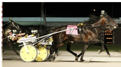
Daylon Magician scored the upset win last night at Northfield.