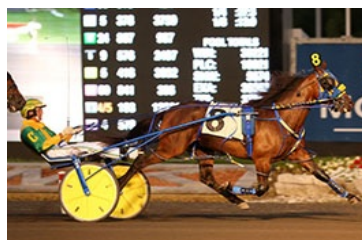
A winner Friday night at Mohawk, Bob Ben And John will be sold today at the Meadowlands

There was a double dose of good news for the sale Friday night as the Rocknroll Hanover 2-year-old Michael's Victory won at the Meadowlands in a non-winners of one in 1:53 and Bob Ben And John won an Ontario Sire Stakes Grassroots race at Mohawk in 1:53.3. Even the Friday morning qualifiers brought with them a positive development as Allstar Legend, who has earned $517,332, won a qualifier at the Meadowlands in 1:50.3, a confidence-booster for