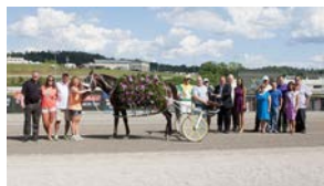
The winning connections in the Adios