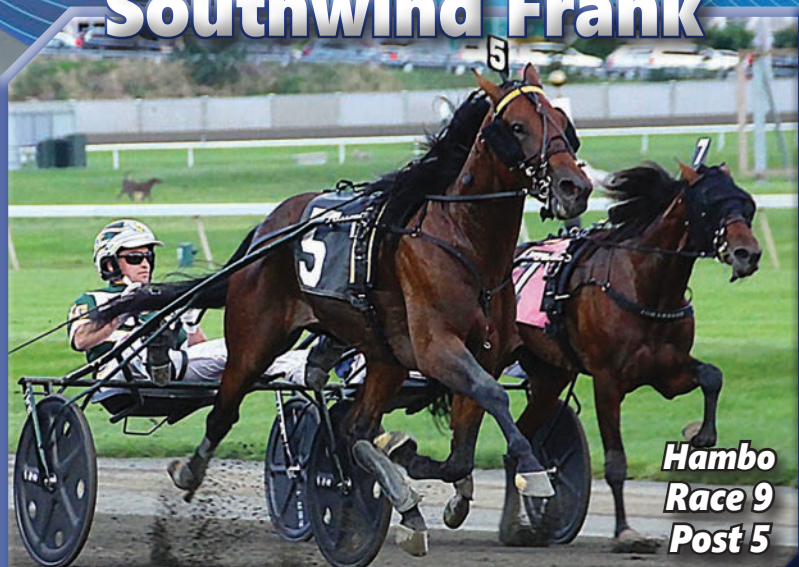
Hambo Race 9 Post 5

Flawless Lindy is a member of our broodmare band.