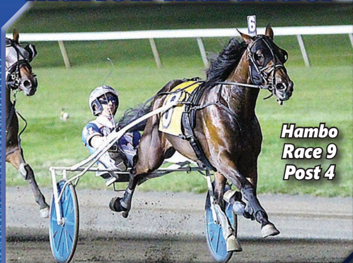
Hambo Race 9 Post 4

Crawford Farms will sell his full brother at Lexington this fall.