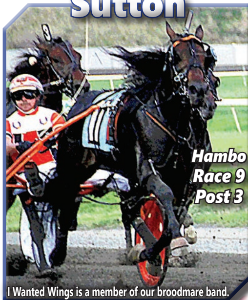
Hambo Race 9 Post 3

I Wanted Wings is a member of our broodmare band.