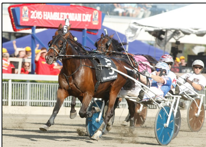
Marion Marauder defeated favorite Southwind Frank by the narrowest of margins in both their elimination and the $1 million final.