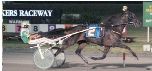
Barn Girl