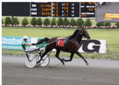
Sebastian K will stand at Hanover Shoe Farms