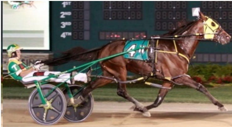
Putting the FREAK in Freaky Feet Pete with a track record mile at Hoosier

Freaky Feet Pete was freaky enough last night at Hoosier Park to get his connections to talk about a Breeders Crown engagement for their homebred start three-year-old colt pacer.