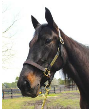
Mission Brief might try the boys again this year