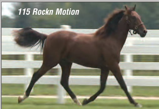
115 Rockn Motion

September 16 & 17 • Eden Park Equestrian Complex, Sunbury, Ohio