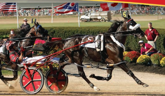
2015 Little Brown Jug winner WIGGLE IT JIGGLEIT