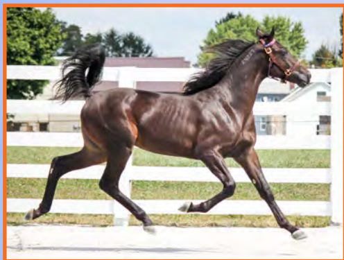
Hip#69: SUPER PAC HANOVER Bc, 4/12/2015

Half-brother to TEA POT HANOVER p,3, 1:52.3f ($188,483), TEMPSTER HANOVER p,4, 1:50.4f ($183,578) and TECHTOR HANOVER p,4, 1:51.3f-'16 ($121,478). From the first crop of World Champion PET ROCK p,4, 1:47 ($1,984,204).