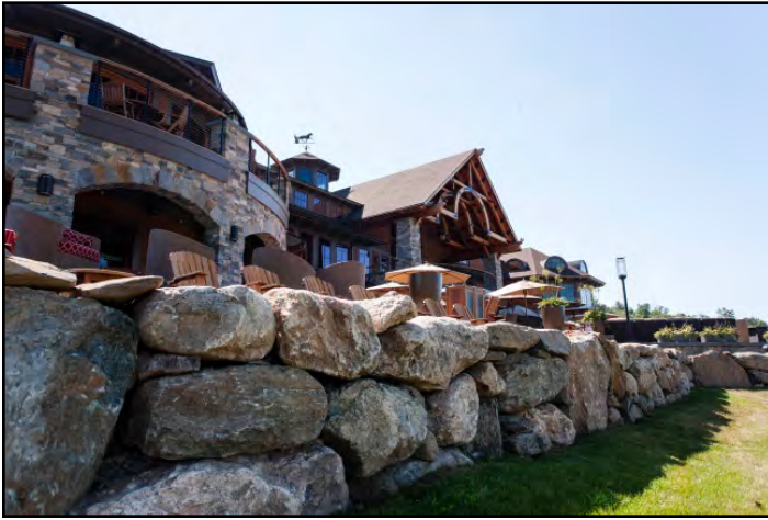
GreatHorse private golf club features incredible views from the new stone clubhouse.