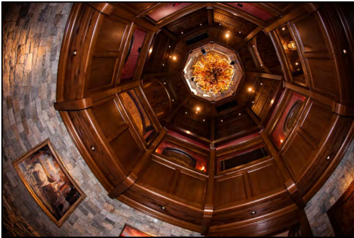
The soaring ceiling is the centerpiece of the GreatHorse clubhouse.