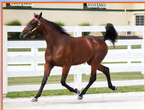
Hip#46: BELLA GIRL HANOVER Bf, 2/27/2015

FRI., SEPT. 16 & SAT. SEPT. 17 ★ EDEN PARK EQUESTRIAN COMPLEX ★ SUNBURY, OH