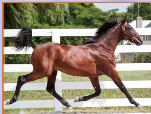
Hip#80: TIVO HANOVER Bc, 5/15/2015

Half-sister to BOCA HANOVER p, 1:51.1f ($562,562), BLOGETTE HANOVER p,3, 1:51.2f ($214,525) and 3 other sub $100,000 winners, including BRISONETTE HANOVER p, 1:54.2f, the dam of BLUSH HANOVER p, 1:51.3-'16 ($254,216).