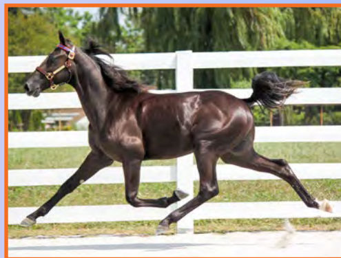
Hip#82: OPPIA HANOVER Brc, 4/28/2015

Full-brother to SCANDALOUS HANOVER p,3, 1:49.3f ($363,570) and to the dam of FIRST CLASS HORSE p,4, 1:51f-'16 ($215,149). Half-brother to JAZZ BAND p, 1:51.4 ($397,062) and to the dam of MISO FAST p,2, 1:53.1f-'16 ($79,636). From the family of WELL SAID p,2,1:51m; 3,1:47.3m ($2,569,342).