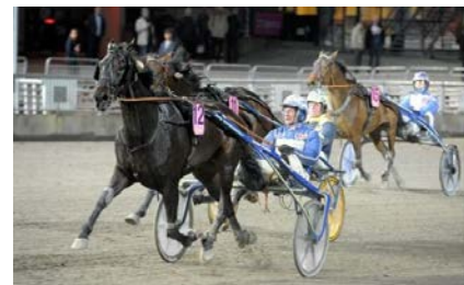
Finnish star Seabiscuit, who is by Credit Winner, is heading to the Yonkers International