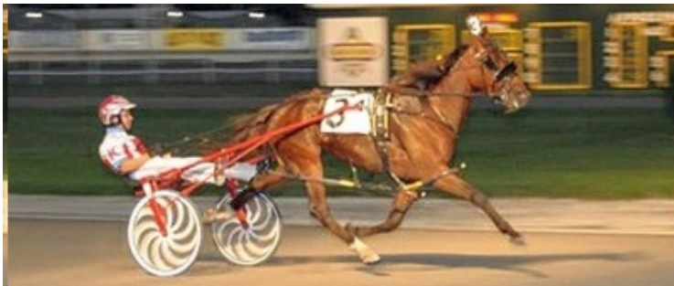
Dime A Dance

BATAVIA, NY - A lightning-fast track and 80 degree temperatures greeted the New York Sire Stakes 2-year-old pacing fillies at Batavia Downs where two divisions offering a total of $109,000 in purses, along with important points needed to make the NYSS final, were up for grabs on Wednesday night (Sept. 16).