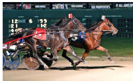
MJB Got Faith winning the Ohio Sire Stakes final Saturday at Scioto