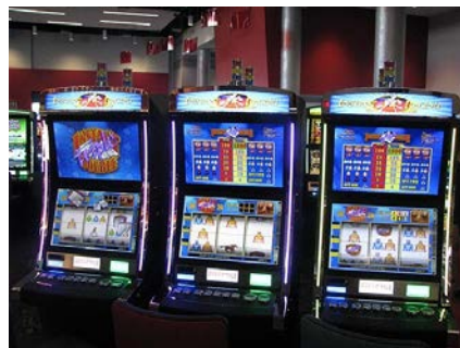
Three of 902 Historical Racing Machines at the Red Mile

Kentucky racing, both thoroughbred and standardbred, has been engaged in a long fight to bring gaming to the racetracks, many of whom have suffered because they have to go up against racino tracks in nearby states like Indiana and Ohio. The most desired result would have been to get slot machines or, better yet, full-fledged casinos, at the racetracks, but that battle kept ending in defeat. Historical Racing machines are meant to look like slot machines but the whether the player wins or loses actually rests on the outcome of an old horse race. Gamblers don't dislike them, but they clearly like real slot machines better. Costa realizes that is a challenge.