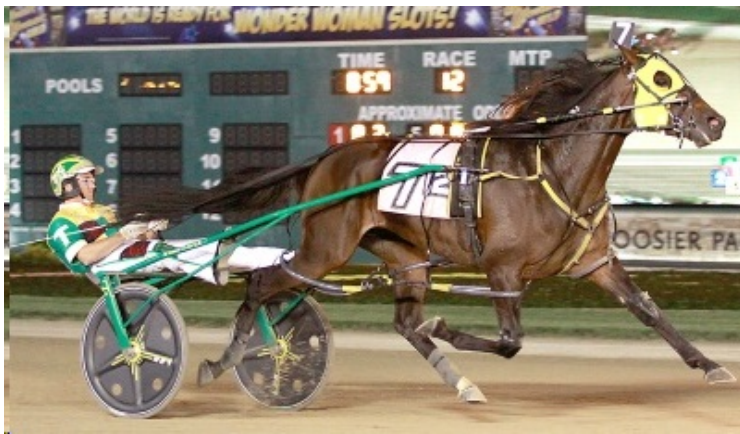
Freaky Feet Pete