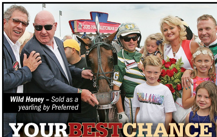
Wild Honey – Sold as a yearling by Preferred