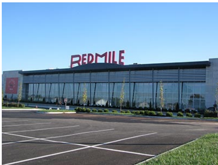
The new look Red Mile

The Red Mile didn't have a particularly robust betting