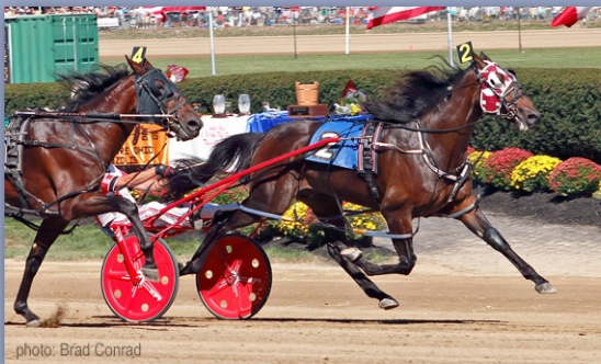
Mr Right Hanover

Spider Man Hanover leads way with world-record performance, winning in 1:51.4