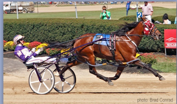
Spider Man Hanover

c, Somebeachsomewhere-Mouse Hanover-Western Ideal p. 2, 1:52.4F ($42,454)