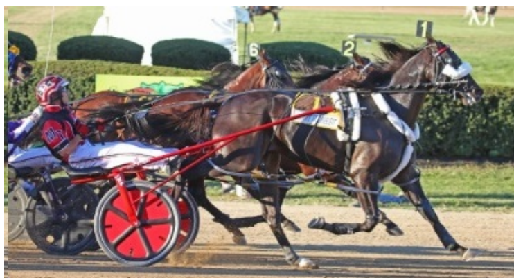
In an incredible performance, Wiggle It Jigglet captured the Little Brown Jug

Doing it the tough way for the second time in a couple of hours following a hard-fought elimination win over Artspeak, heavy favorite Wiggle It Jigglet survived an all-out war with first elimination winner Lost For Words to nose that rival out right on the wire in 1:49 3/5.