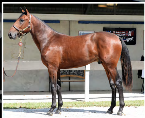
Hip 60 – Captaintremendous Captaintrecherous \frac{3}{4} brother to World Champion Beach Memories!