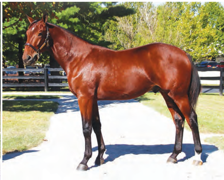
Hip# 66 • Captain Sunshine CAPTAINTREACHEROUS colt, half brother to FLYME TO THE MOON p,3,1:53.4f-'17 ($42,922).