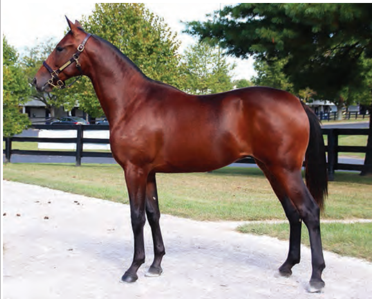
Hip# 14 • Trix And Stones TRIXTON colt, half brother to BUEN CAMINO 1:52f-'17 ($564,251).