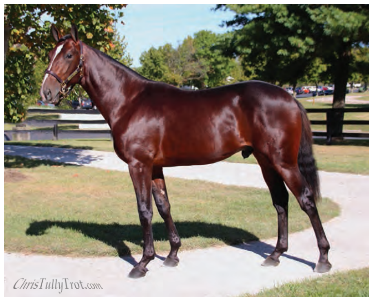
Hip# 78 • Love Me Some Lou SWEET LOU colt from a half sister to 2 in 1:49f or faster.

Hip# 72 • Stonebridge Soul SOMEBEACHSOMEWHERE filly, first foal from ROCK N SOUL p,1:49.4f ($1,158,525).