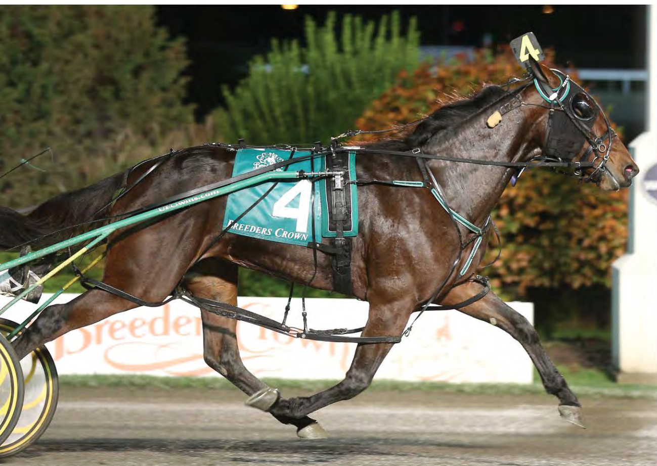
AMERICAN JEWEL American Ideal-Trim Hanover-Camluck

By American Ideal, established or equalled four World Records and retired as the fastest 3-year-old pacing filly in history. She was Canada's O'Brien Award winner at 2, and swept both the Dan Patch & O'Brien Awards at 3.