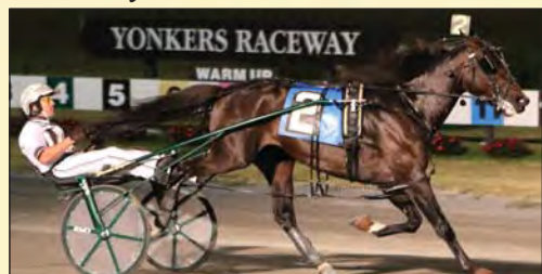
HABITAT 3,1:53f-'15 ($1,104,841)

Selling at the Lexington Selected Yearling Sale October 5 - 9