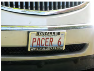
But would they buy a trotter?

"The people I am involved with from Europe are very wealthy," he said. "So I don't think this will be a big deal to them. Maybe it will be for some smaller, average buyers.