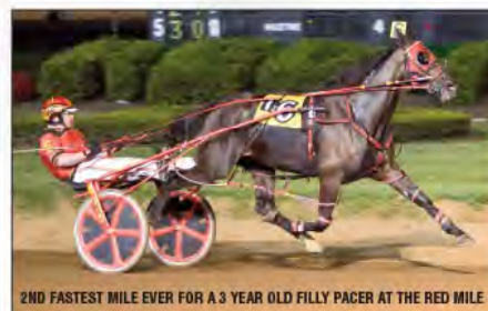
2ND FASTEST MILE EVER FOR A 3 YEAR OLD FILLY PACER AT THE RED MILE