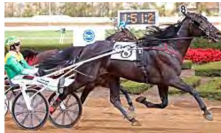
Creatine has returned home for the Yonkers International