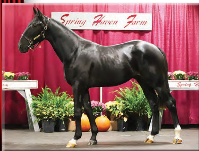
Hip# 599 • Shadow's Wish SHADOW PLAY full brother to BROOKDALE SHADOW p,3,1:51.2 ($244,203)