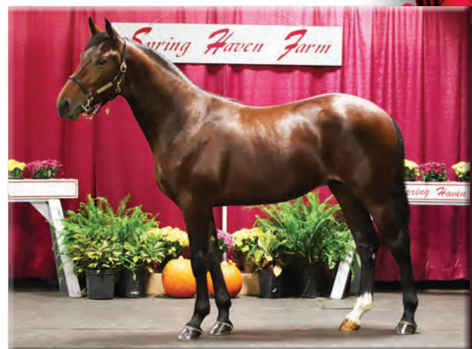
Hip# 864 • Rose Run Unclebuck UNCLE PETER colt, first foal from TAMEKA SEELSTER 1:55.2f ($179,142)

11209 Stout Road • Utica, OH 43080 • (740) 745-1170 • SpringHavenFarm@aol.com