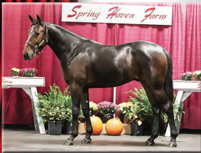
Hip# 514 • El Treston E L TITAN colt from a half sister to GREAT SUCCESS 3,T1:51.2 ($400,205)