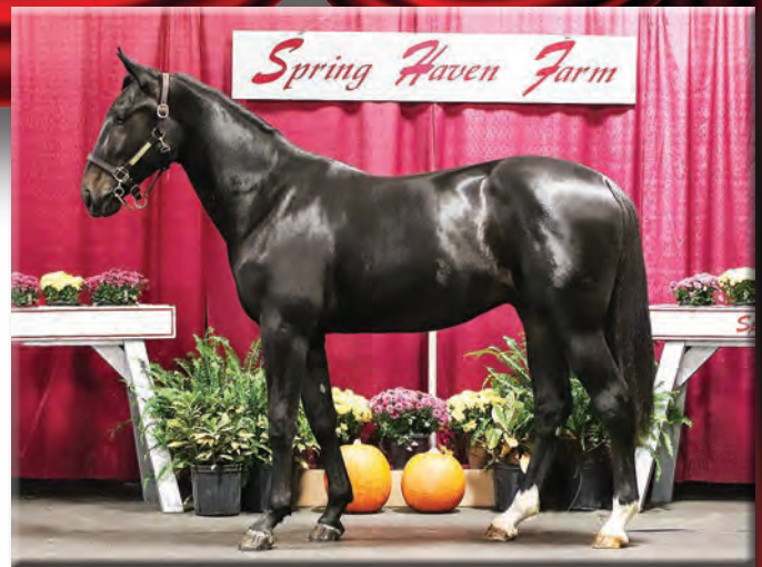
Hip# 541 • Ablegate EXPLOSIVE MATTER half brother to COMMON PARLANCE 3,1:54.4f ($81,372)