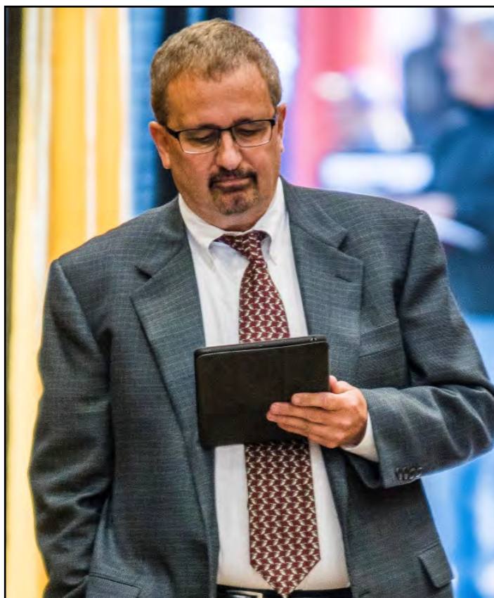
2016 File Photo

"The differences ought to really show up (Wednesday)," Spears said. "Traditionally, it's the lightest of the three days. So, I think we're looking at a good day again (Wednesday) and there's still a lot of people who need horses."