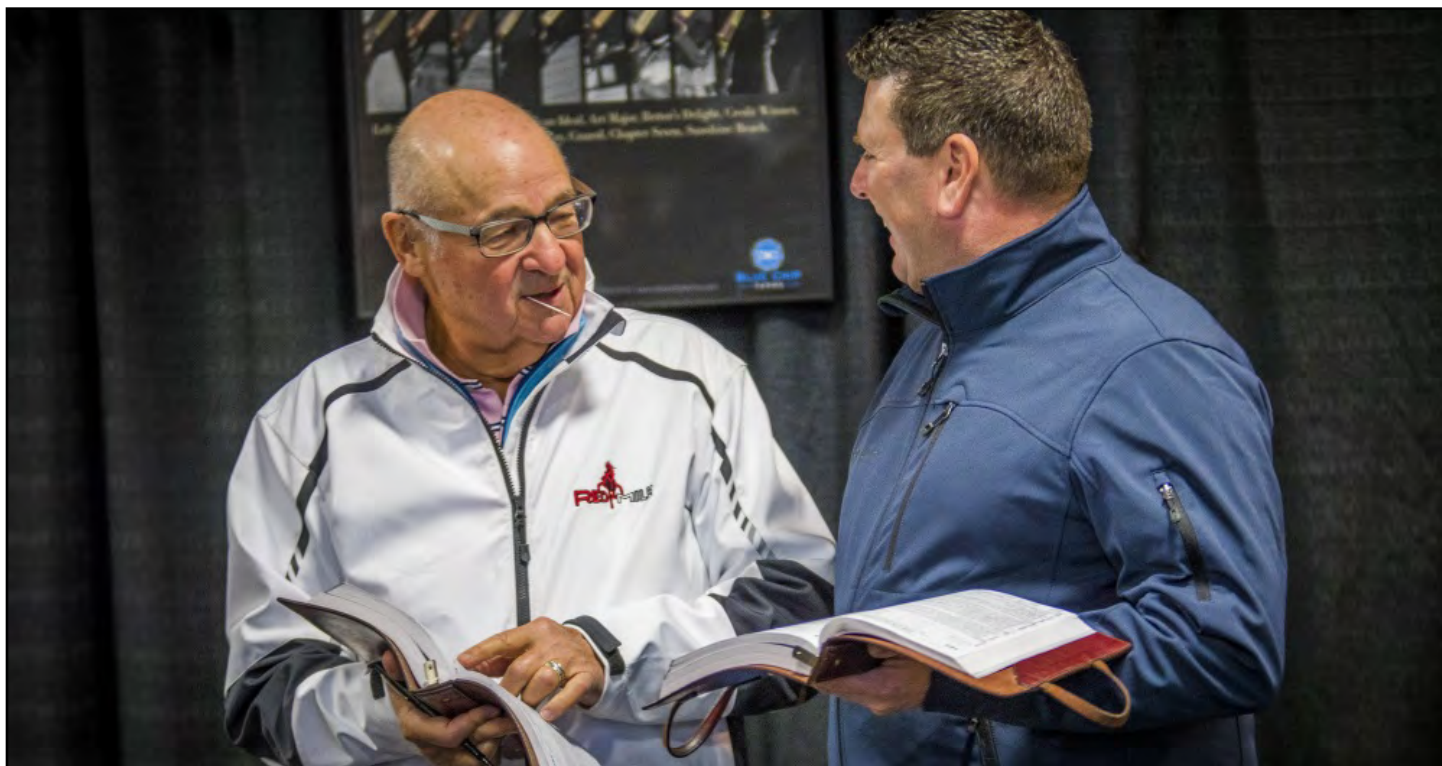
Triscari Video Web and Marketing