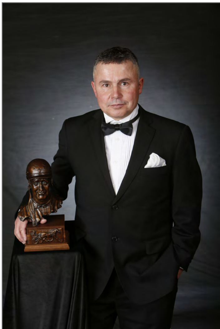
Iron Horse Photo

What few people know is the clear mandate of O'Brien Award voters is to select the people and horses that "made the greatest contribution to Canadian racing." That's left up to voters, as it should be, to decide what that means to them. By rule, people and horses do not have to be Canadian. There also is no rule that they have to operate in the country (other than the new trainer restrictions and a requirement that horses have to race at least three times that year in Canada