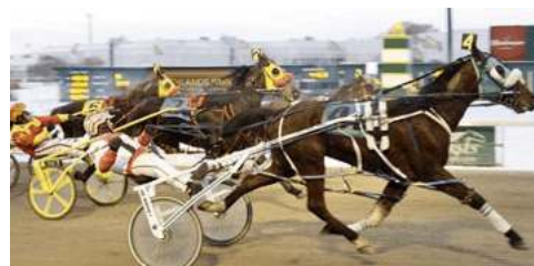
Silver Eagle