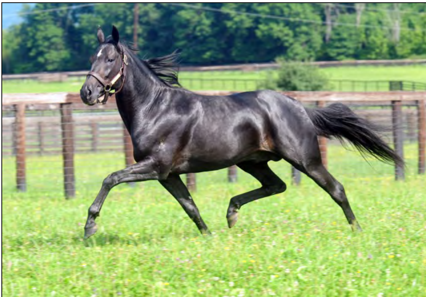
Crazed will be standing at Tara Hills Stud in Ontario in 2017.