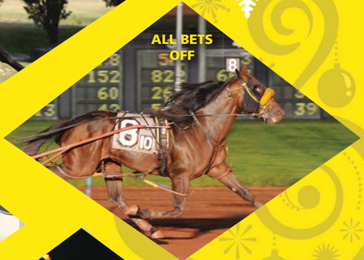
ALL BETS OFF