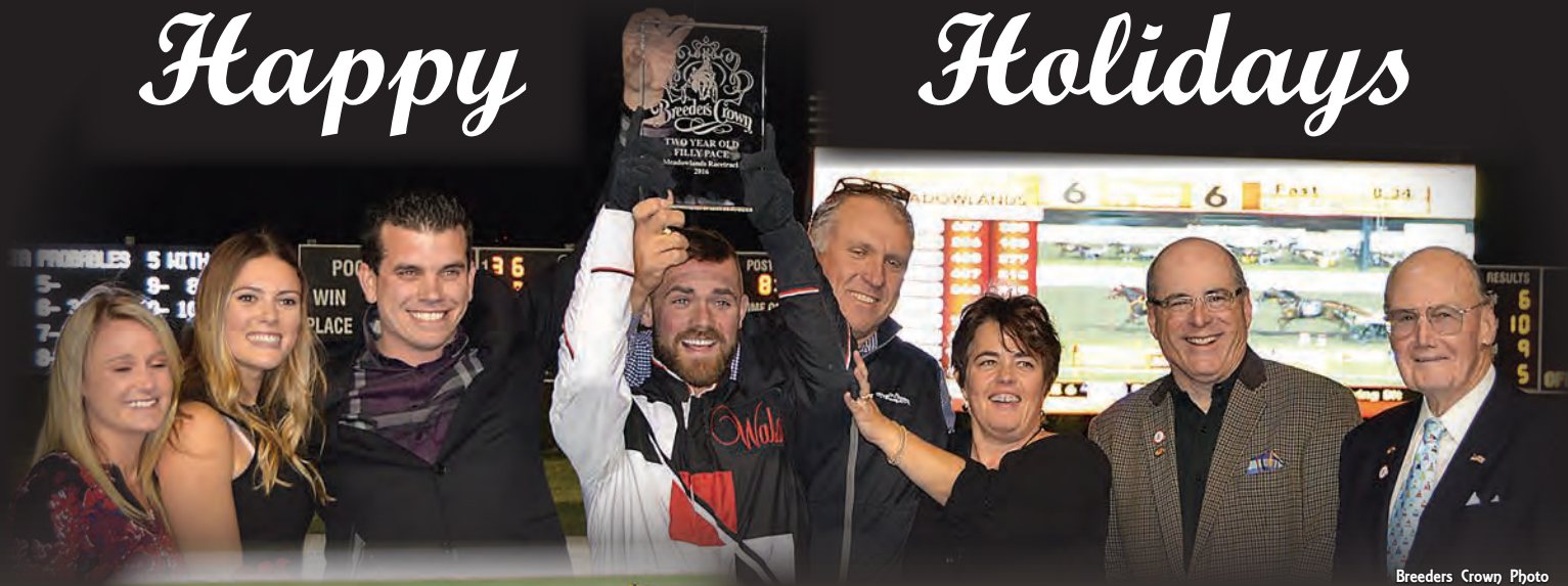
Breeders Crown Photo