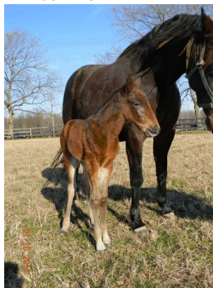
The newest addition to the Winbak family

As the new year begins, so does foaling season at Winbak Farm.