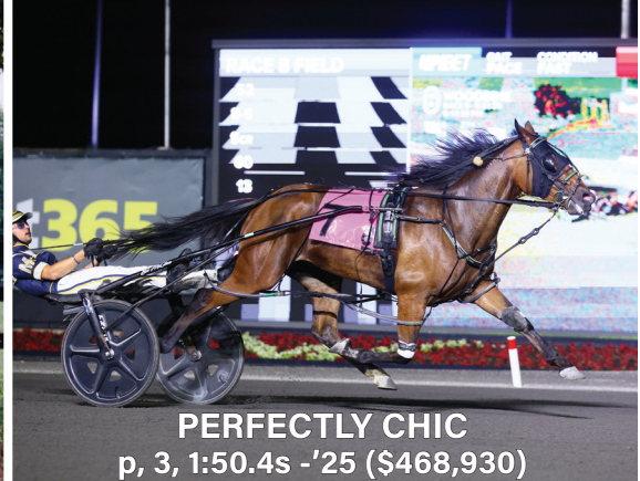
PERFECTLY CHIC p, 3, 1:50.4s -'25 ($468,930)