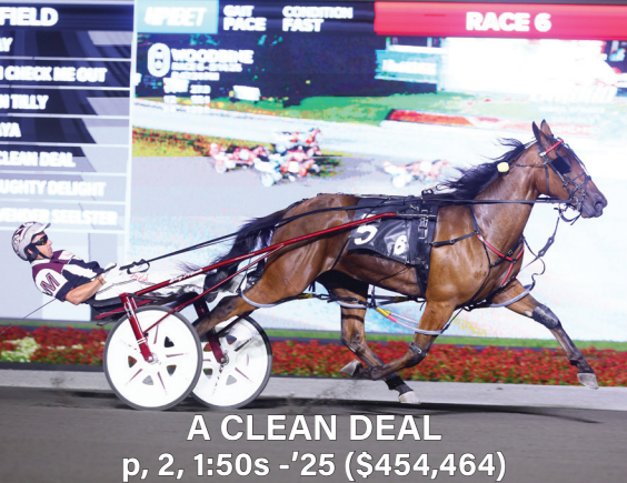
A CLEAN DEAL p, 2, 1:50s -'25 ($454,464)