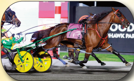
SYLVIA HANOVER Older Pacing Mare