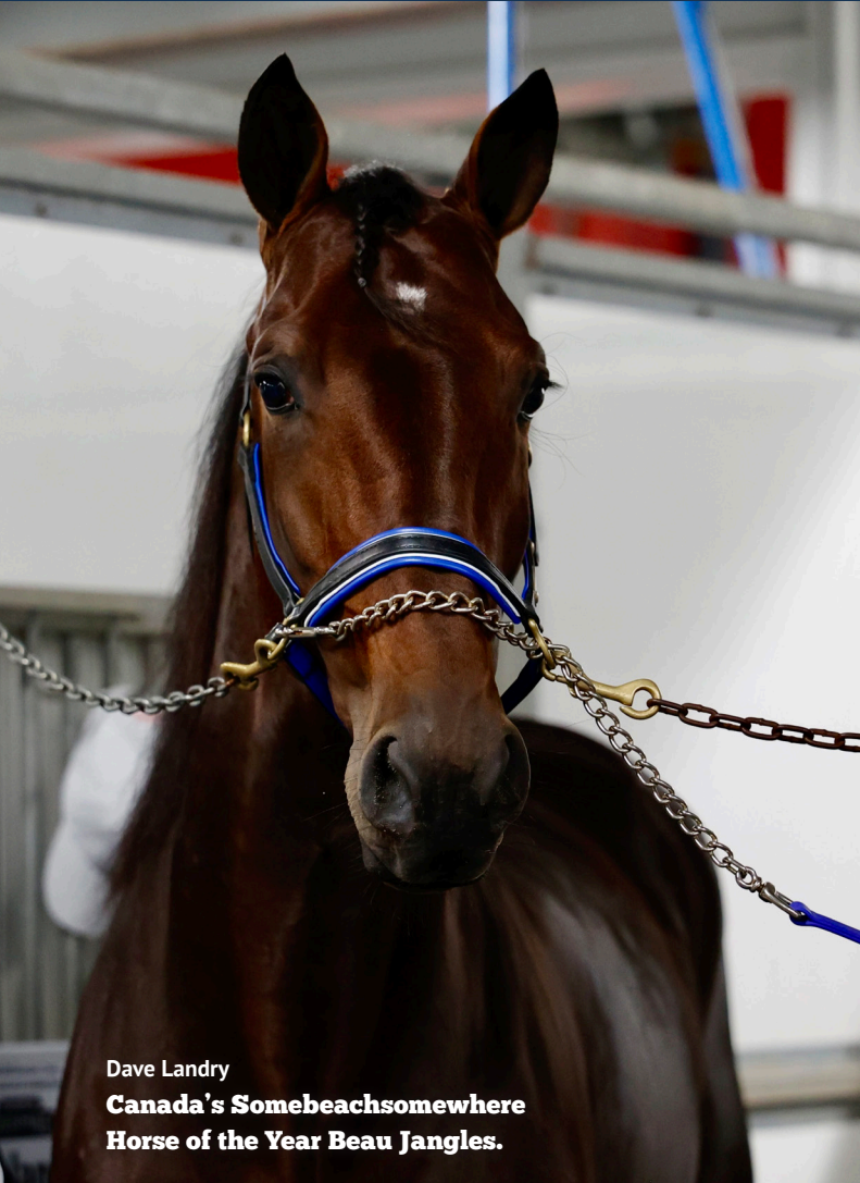
Canada's Somebeachsomewhere Horse of the Year Beau Jangles.