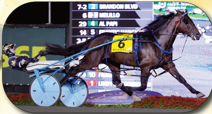
BEAU JANGLES Horse of the Year 2YO Colt Pacer