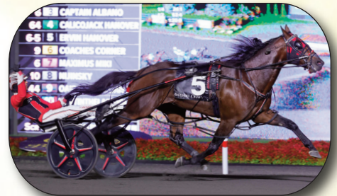
ERVIN HANOVER Older Pacing Horse

To enter call (717) 637-8931 or email harrisburgsale@theblackbook.com