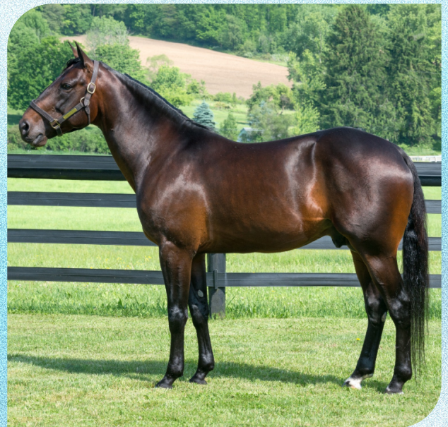
CAPTAIN TREACHEROUS - ARIA HANOVER - WELL SAID 2, 1:51.2; 3, 1:48.4; 4, 1:47.4M