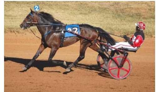
Wishing Stone will race from the first tier in the 1 5/16 mile event. (Cont.)

A total of 13 trotters were entered in the race. The nine horses with the most winnings