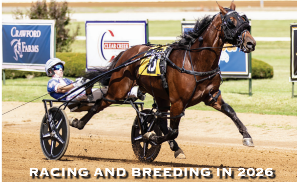
RACING AND BREEDING IN 2026

(Captaintreacherous - Cinamony - Art Official) p,2,1:49; 3,1:48 -'25 ($1,573,723)