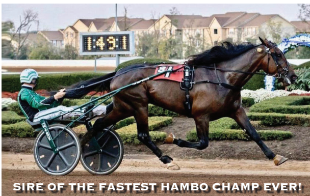
SIRE OF THE FASTEST HAMBO CHAMP EVER!

(Muscle Mass - Pleasing Lady - Cantab Hall) 3,1:49.1 ($1,973,661)