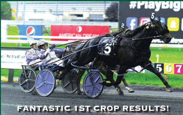
FANTASTIC 1ST CROP RESULTS!

(Always B Miki - Shebestingin - Bettors Delight) p,2,1:49.2; 3,1:48.1 ($1,861,447)