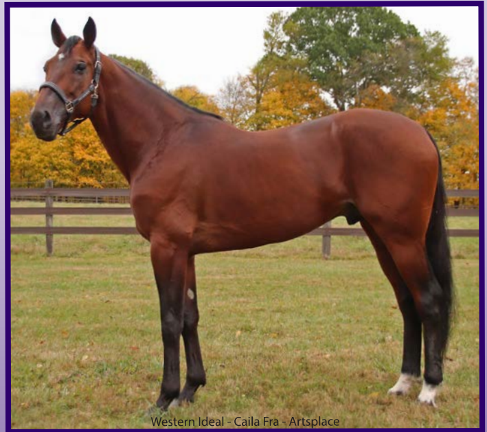
Western Ideal - Caila Fra - Artsplace