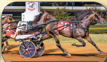
SUPER CHAPTER 3YO Male Trotter