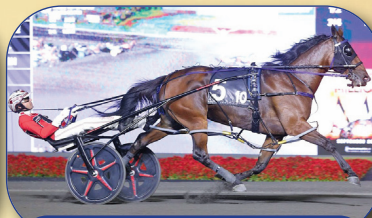
TWIN B JOE FRESH Older Female Pacer