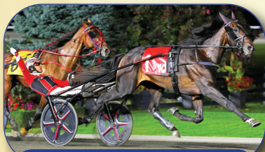
APEX 2YO Male Trotter