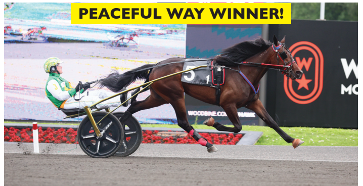
SUGAR PACKET 2,1:53.3s ($327,147)

His three-year-olds earned $2,432,099 in 2025 - an avg/starter of $62,361 His two-year-olds earned $1,182,108 in 2025 - an avg/starter of $45,465