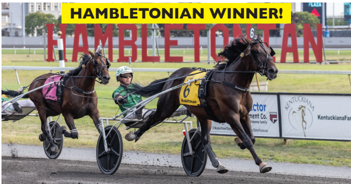
NORDIC CATCHER S 3,1:50 -'25 ($1,124,113)

The sire of both the 2025 HAMBLETONIAN CHAMPION and the 2025 PEACEFUL WAY CHAMPION!