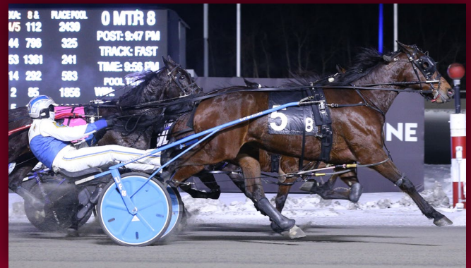
#19 LOCATELLI 4,1:50.4s ($425,324)

View our roster | View past performances