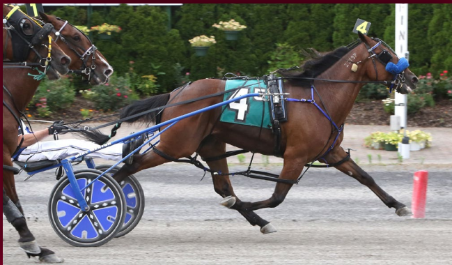
#18 SAULSBROOK HERO p,5,1:51.3f ($189,257)