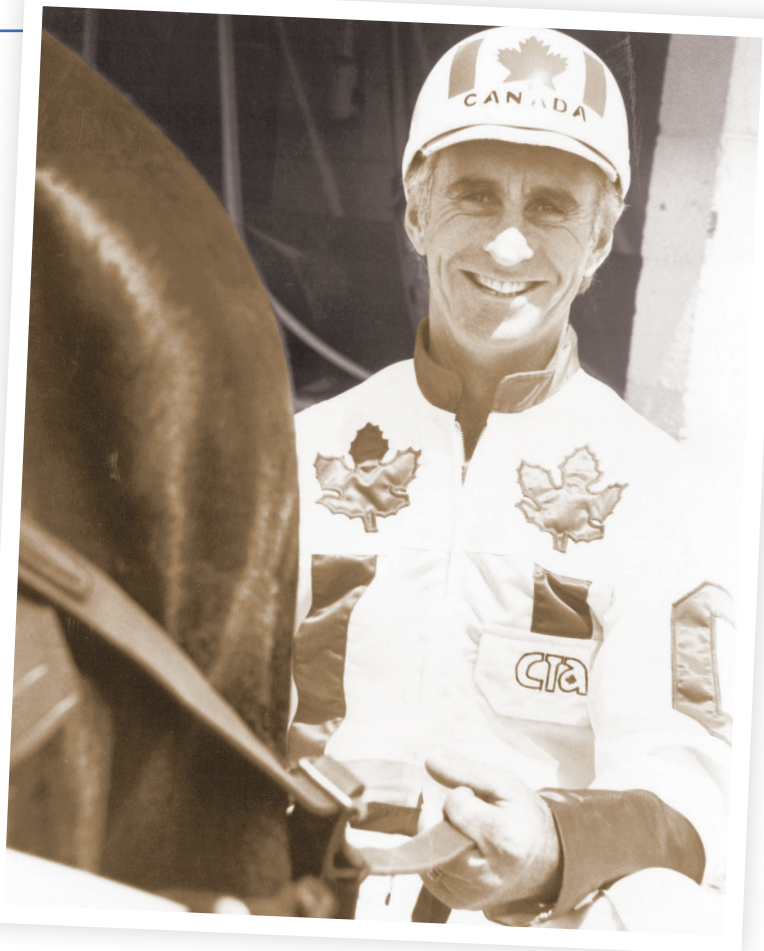
Canadian Horse Racing Hall of Fame