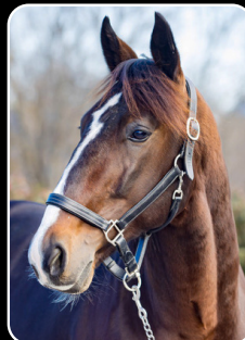
CUATRO DE JULIO

Trixtton – Ready Cash $5.000, standing in Ohio