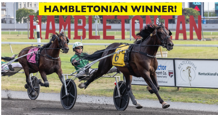
NORDIC CATCHER S 3,1:50 -'25 ($1,124,113)

The sire of both the 2025 HAMBLETONIAN CHAMPION and the 2025 PEACEFUL WAY CHAMPION!