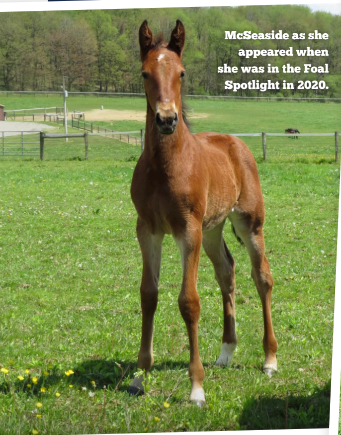
McSeaside as she appeared when she was in the Foal Spotlight in 2020.