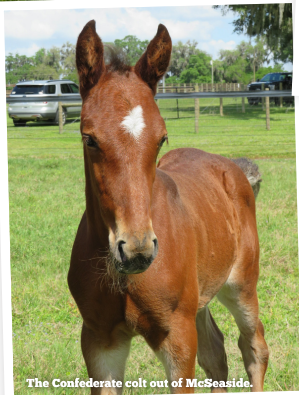
The Confederate colt out of McSeaside.