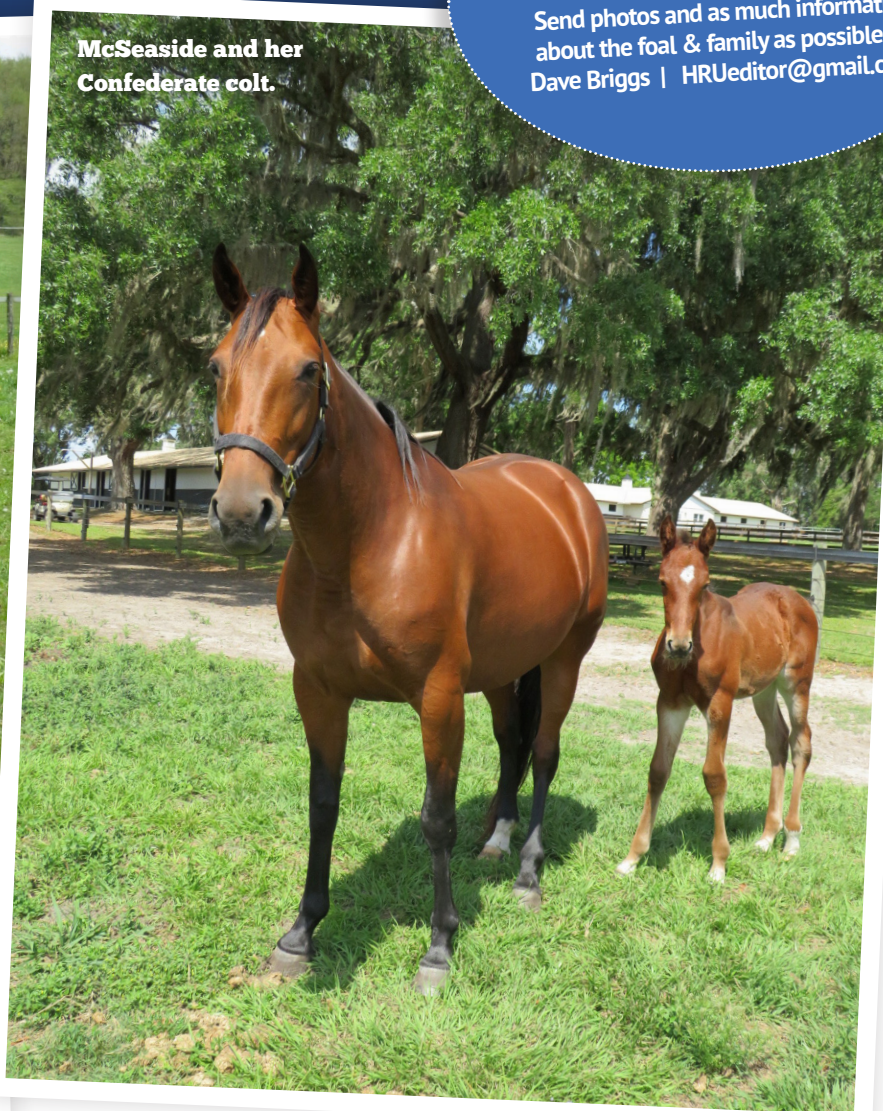
McSeaside and her Confederate colt.